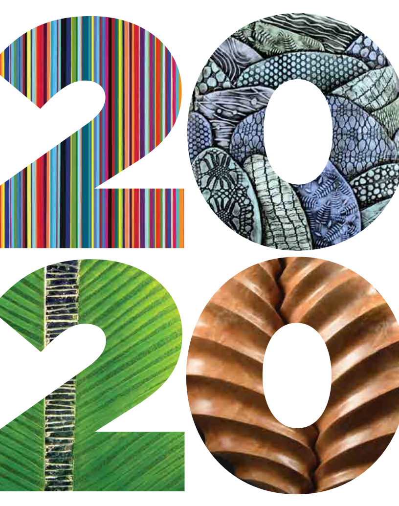
A YEAR OF PERFECT VISION