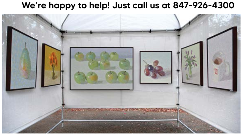
Outstanding booth image example