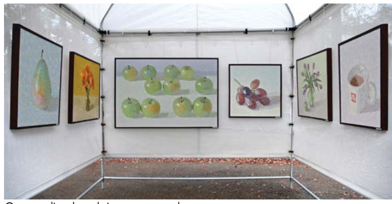
Outstanding booth image example

We're happy to help! Just call us at 847-926-4300